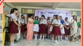
2nd Installation of Interact Club of Bidya Bharati Girls' High School