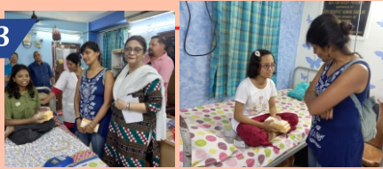
Distribution of 36 packets of tablets each box containing 30 tablets to 13 beneficiaries worth INR 36,000 at Hematology Foundation, 62, Rakhil Das Adday Lane