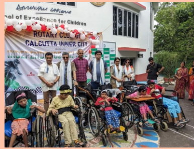
Distribution of wheelchairs at School of Excellence for Children with Special Need - Asha Bhavan, Uluberia