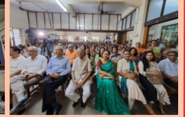
Flag hoisting and celebration of Independence Day at Bidya Bharati Girls' High School