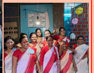
Opening of two toilets at Central Avenue in association with The Hope Kolkata Foundation